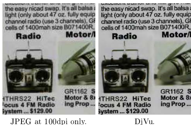
Figure 4: Comparison of JPEG at 100dpi (left) with quality factor 30% and DjVu (right). The images are cropped from hobby002 . The file sizes are 82K for JPEG and 67K for DjVu

Figure 4 shows a more global comparison between DjVu and JPEG-100.