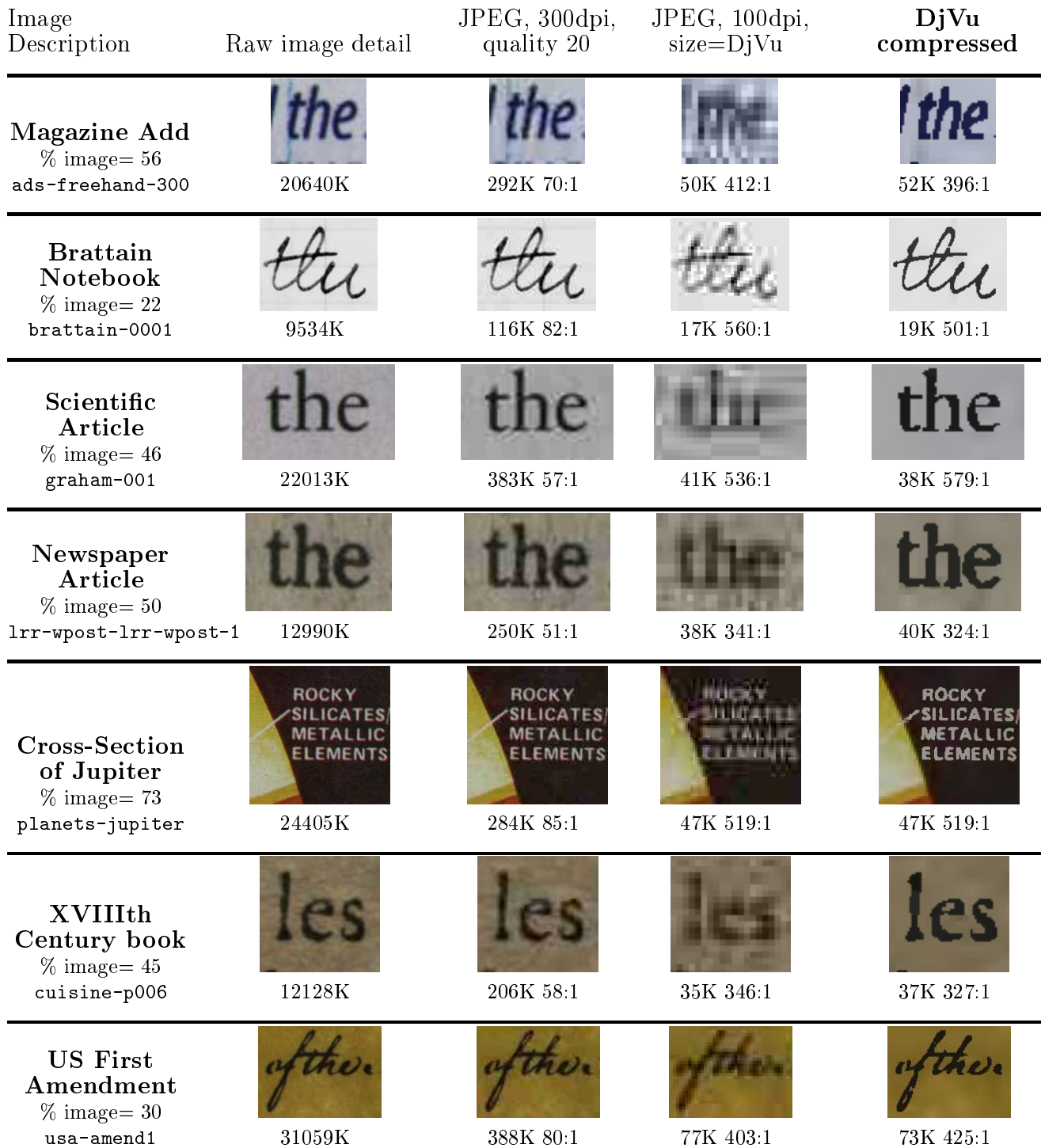
Figure 3: Compression results for seven selected images with 4 compression format. Raw applies no compression. JPEG-100 quality ranges from 5 to 50, the value yielding the compression rate which is the closest to DjVu is chosen. The “% image” value corresponds to the percentage of bits required to code for the background. Each column shows the same selected detail of the image. To make selection as objective as possible, when possible, the first occurrence of the word “the” was chosen. The two numbers under each image are the file size in kilobytes and the compression ratio (with respect to the raw file size).